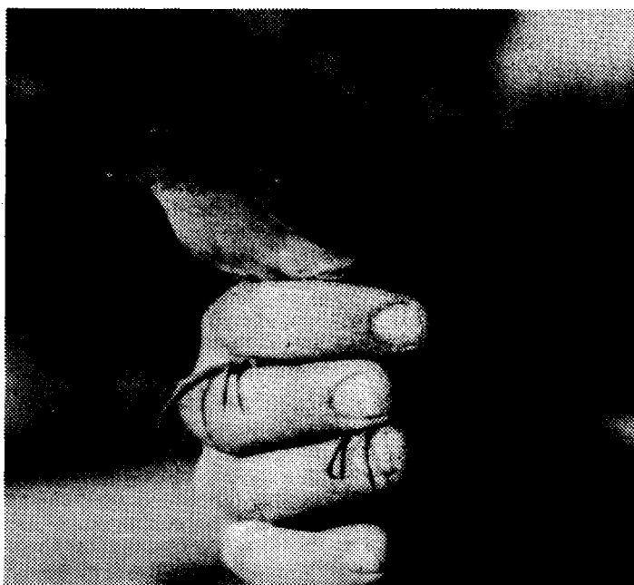
The tiny Baillon's (Marsh) Crane has only been recorded from November to January in the Waterbird Project and is suspected of migrating to northern Australia or beyond. This same species crosses the Sahara Desert each year! Note its long toes which enable it to walk on floating water-weed. 1