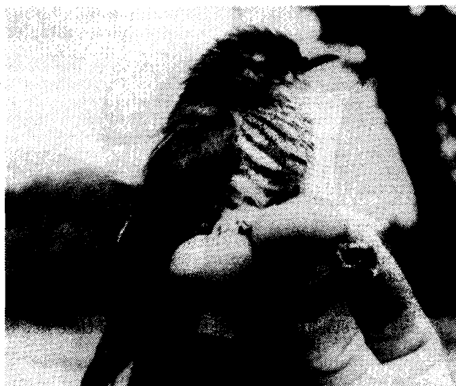
Shining Bronze-Cuckoos were observed on the Yanchep excursion and a juvenile was being fed by foster parents during the Woodanilling Campout.

A group of about 30 people braved an adverse weather forecast to gather at Giddegannup before moving onto the National Park.